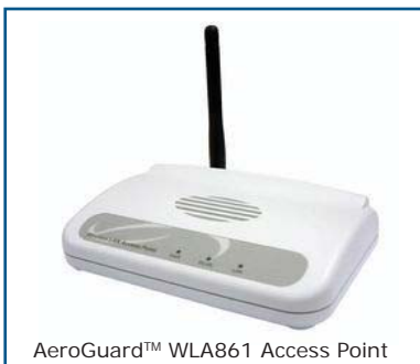
AeroGuard™ WLA861 Access Point

Complete Accounting and Billing - Supports multiple local or remote authentication methods for managing up to 5000 on-demand accounts. Multiple account profiles are configurable by role or policy to support both amenity and fee based user access models.