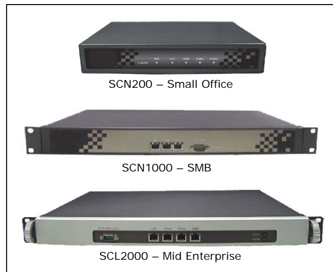
BroadScan™ Spam-Virus Firewall Appliances

It is now the general consensus that an all-in-one, unified threat management (UTM) appliance is able to provide performance greater than or equal to that of a single application appliance deployed by service providers and enterprise IT. This is good news for small and mid-size business managers who benefit the most from an integrated approach that reduces complexity and cost associated with single application appliances. Plus, a UTM approach allows for simpler optimization of their multi-function roles for customer specific needs provided easy-of-use in both management and reporting are a design attribute. High