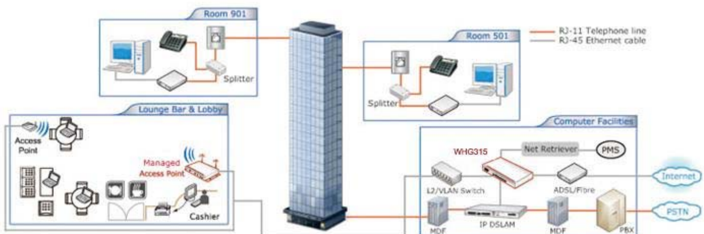
Fig.2. WHG315 in a Hotel - Capable of integrating with DSLAM and PMS

In summary, the feature-rich WHG315 supports multiple business models of Internet Access Services - be it for managing wireless or wired clients. It can be configured to fit for private corporations, government agencies, academic campuses, multi-tenant units (MTU), hotels, WISP hotspot operations. The 4ipnet WHG-series products aim to offer the best price-performance among all access controllers on nowadays market.